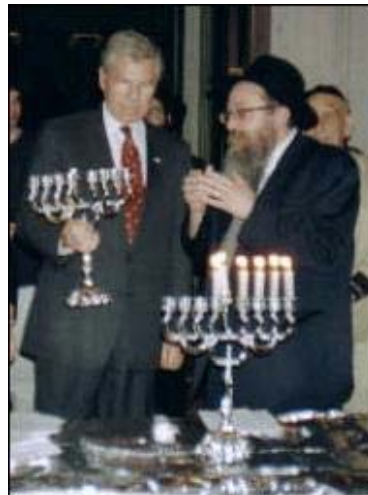
Governor of Rhode Island, Donald L. Carcieri